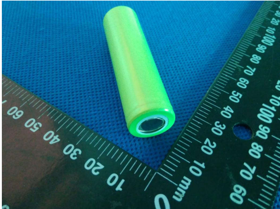
电池（外观） Cell (Exterior)