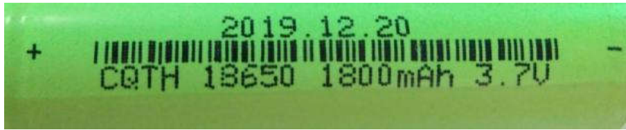
电池铭牌 Cell Nameplate