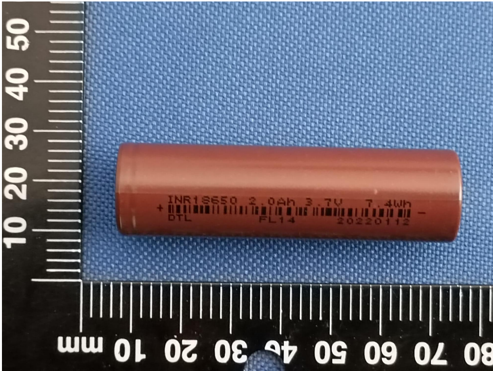
Front view of cell