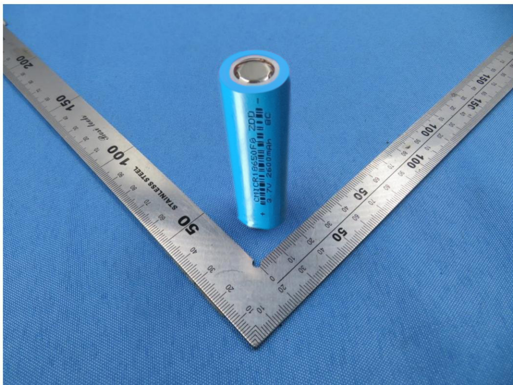
Picture 2 Side view of cell