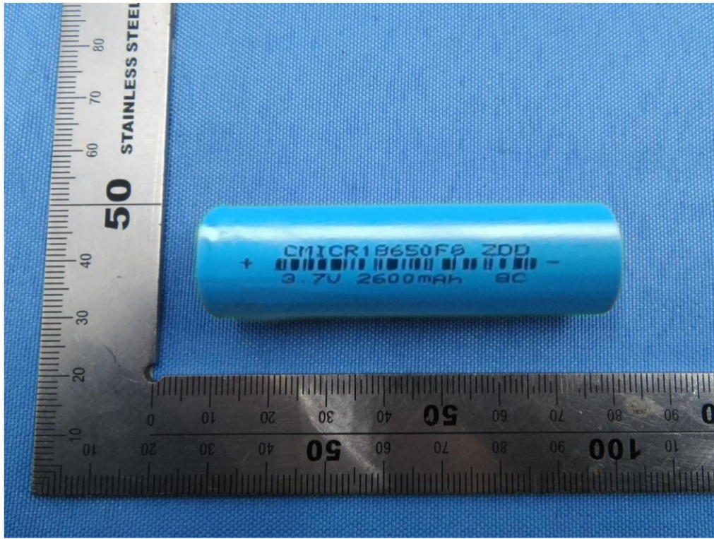
Picture 1 Front view of Cell